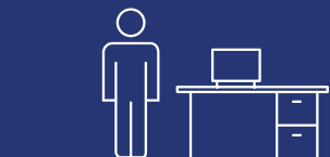
Service Delivery Manager