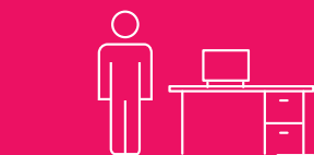
Service Delivery Manager