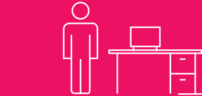
Service Delivery Manager